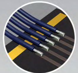
30 AWG Power