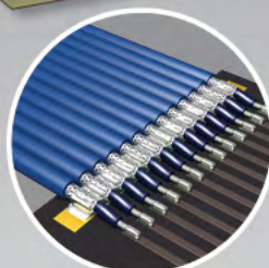
38 AWG Coax

* Card on cable mates with board level connector.